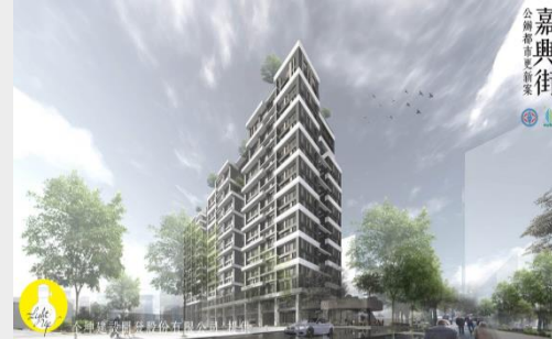
Jia Xing Jie