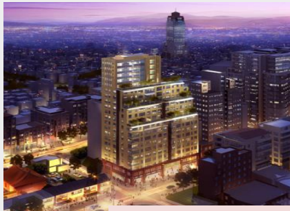
Quiyang st. II