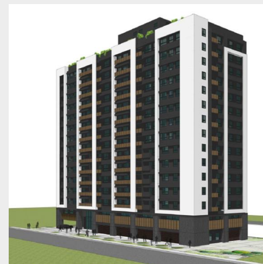
Bali Taipeigang section