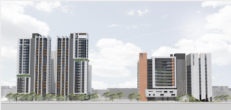
Christianity Jie Cai Zhong Hui