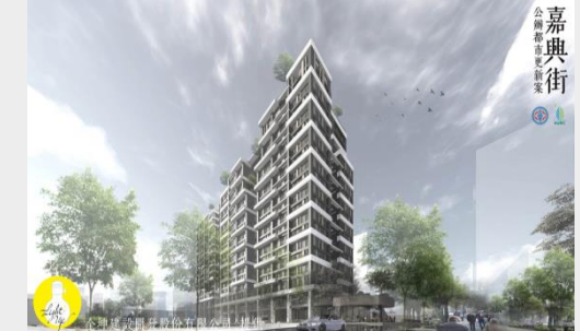
Jia Xing Jie