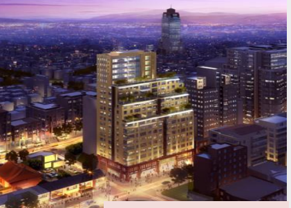
Quiyang st. II