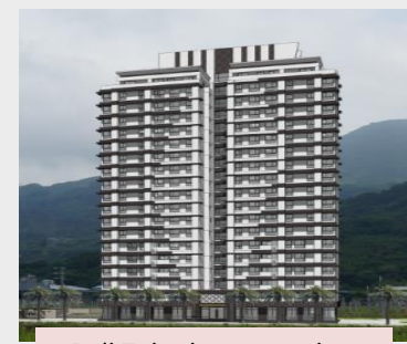
Bali Taipeigang section